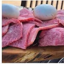
Japanese Wagyu Steak 頂級和牛

our premium meats are prepped, seasoned and marinated in house BBQ served with rice, our fresh banchan ("side dishes"), Miga Salad or Lettuce wrap