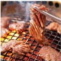
Yang Nyum Galbi 牛排

our signature fresh AAA+ prime ribeye (200g) salt and pepper, olive oil, sesame oil $42.95