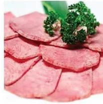
Premium Ox Tongue 特 质牛舌

buttery and perfectly marbled prime Wagyu A4 sirloin (8 Oz) salt and pepper - from Iwate Prefecture, Japan $98.95