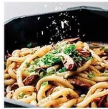
Stir Fried Bulgogi Udon 牛肉炒乌冬

stir fried vermicelli, chopped onion, green onion, soybean sprouts, sesame oil