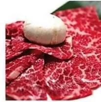
Premium Jumuluk (Ribeye) 特质牛眼肉

thinly sliced natural AAA+ beef tongue $30.95